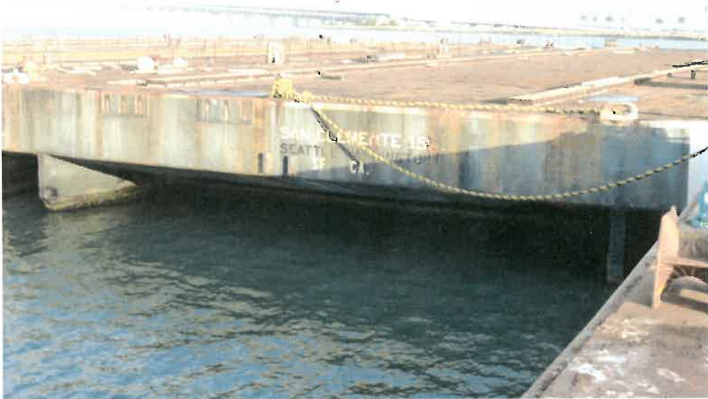
San Clemente Island