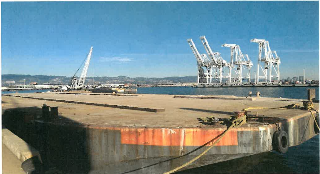
San Clemente Island