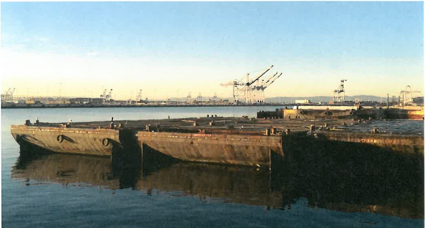
CMC-27 & CMC-35